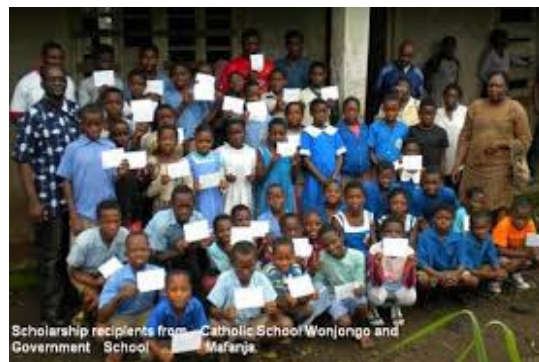
Scholarship recipients from Catholic School Wanjongo and Government School Mafarja

The organisation conducted the programme in New Delhi. Scholarship programme held for the intelligent students organized by faiqua foundation in New Delhi. The organization encouraging the intelligent students in the field of musical arts through scholarship distribution programme to show their best skill development. There